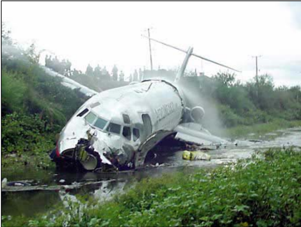
Figure 1. - DC-9 Aircraft Wet Runway Landing Veer-off Accident Reynosa, Mexico; October 6, 2000