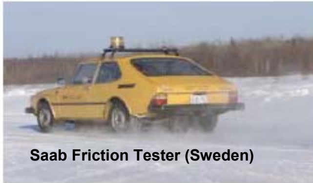
Saab Friction Tester (Sweden)