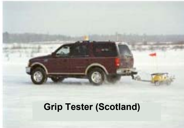
Grip Tester (Scotland)