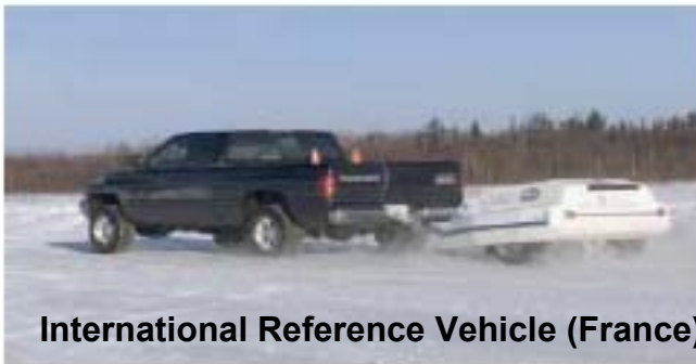
International Reference Vehicle (France)