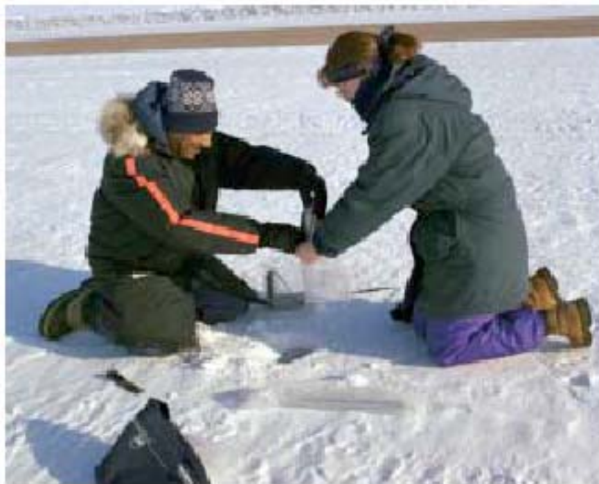
Figure 5. - NRC researchers collecting contaminant sample for analysis