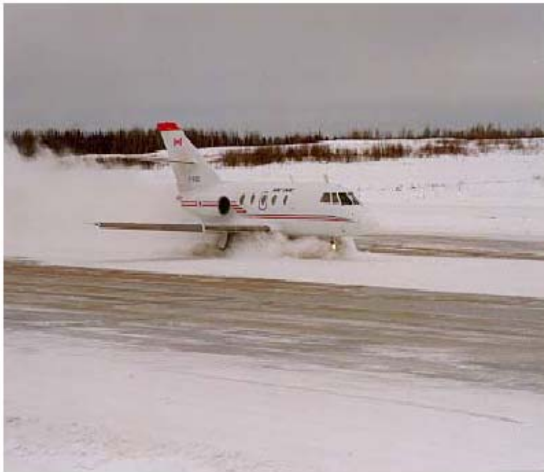
Figure 4. - Photograph of Falcon-20 aircraft during test run on snow-covered runway.